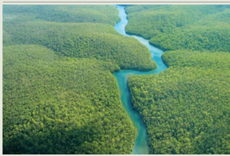
EXHIBIT MEASURING the FATE of the AMAZON through October 25, 2015 Ironwood Gallery